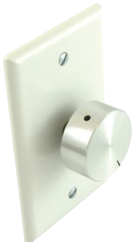
DIMMER AND DIAL AS SEEN INSTALLED IN A SINGLE GANG WALL BOX WITH FACE PLATE (CONTRACTOR SUPPLIED).